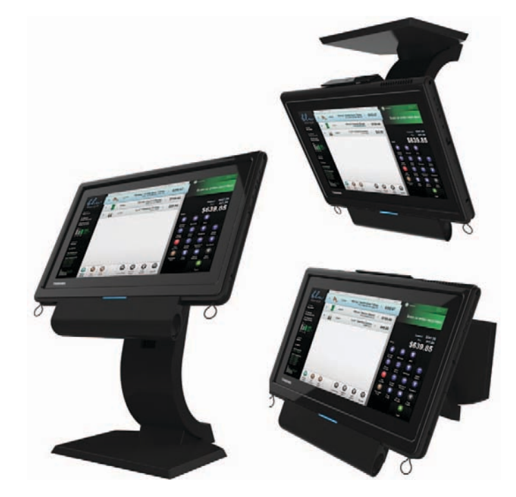
Figure 7. TCxFlight configurations

The low profile dock provides a USB port and an ethernet port for those configurations with limited port requirements. The distributed POS hub can be used with either dock to extend the number of available ports when required. It provides five USB ports and a 24V cash drawer port.