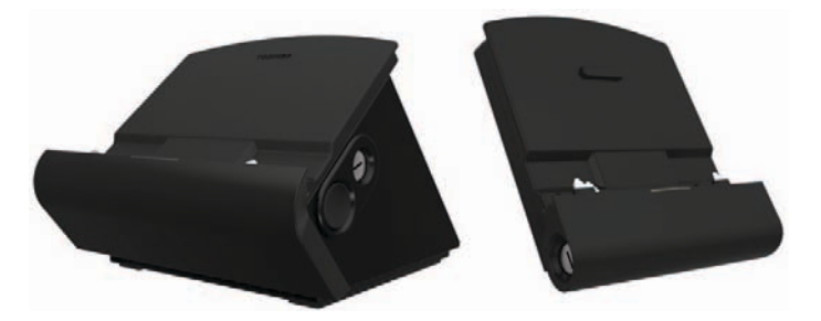
Figure 5 . Dock with Adapter (left), Low Profile Dock (right)

Both docks feature a unique connector that's been designed for years of use in the rugged retail environment. Mobile units can be locked in any dock with the same key used to secure the cash drawer.