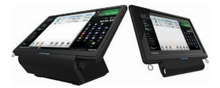
Figure 1. (left) integrated table top configuration using the base dock and a mobile unit, and (right) wall mount configuration using the low profile dock.

Toshiba TCxFlight is a traditional solution to today's core retail requirements. With its elegant design, TCxFlight offers an extension of the Toshiba Global Commerce Solutions portfolio and provides retailers with a consistent look and feel across their store.