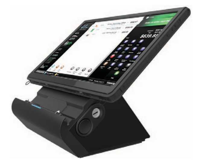
Figure 2 . TCxFlight separating from dock

The mobile hybrid unit shown in Figure 2 is designed to transform back and forth between a fully mobile solution and a traditional fixed function one. The same capability exists with the low profile dock.