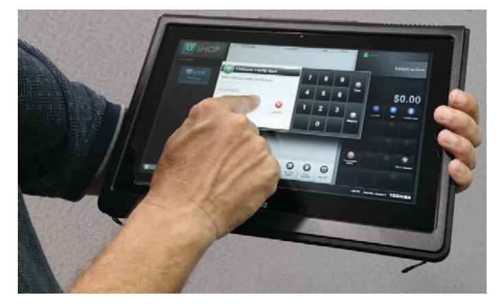
Figure 3. TCxFlight mobile hybrid unit

Optional hand and shoulder straps are available. All straps are simple to adjust and they attach to any of the four tethers on the back of every mobile unit. Straps can be used together, or separately.